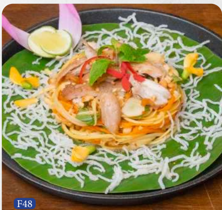
F48 ញ៉ាំស្វាយខ្ចី ជាមួយសាច់មាន់ MANGO SALAD WITH CHICKEN

Grated green mango mixed with grilled chicken, Khmer dressing, roasted peanut and fresh herbs