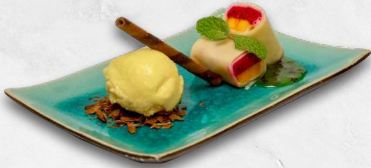
F44 នំអំបែង និងកាវ៉ែមធាសិន

KHMER TRADITIONAL CRÊPE AND PASSION FRUIT SORBET