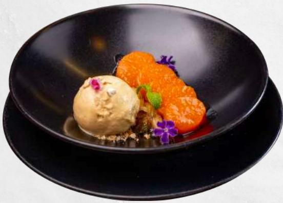
F61 ដំឡូងឆីង និងកាវ៉ែមគ្រាប់ស្នាយចន្ទី