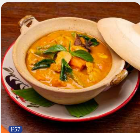
F57 ការិខ្មែរសាច់មាន់ KHMER CHICKEN CURRY Bonelesse chicken simmered in coconut milk and curry broth with sweet potatoes, onions, long beans 36,000 R | $ 8.75