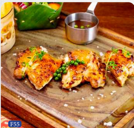
F55 ស្តេកសាច់មាន់ GRILLED CHICKEN Grilled boneless chicken, served with Kampot green pepper sauce, mixed salads and French fries 43,000 R | $ 10.50