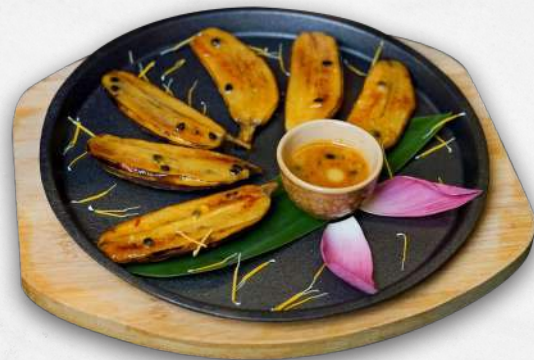
F29 ចេកពងមាន់ច្រៀន ទឹកជ្រូលកំផាសិន