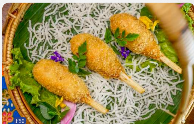
F50 ប្រហិតត្រីបំពង DEEP-FRIED FISH CAKE

Deep-fried river fish paste mixed with Kreoung Khmer, served with vegetable pickle