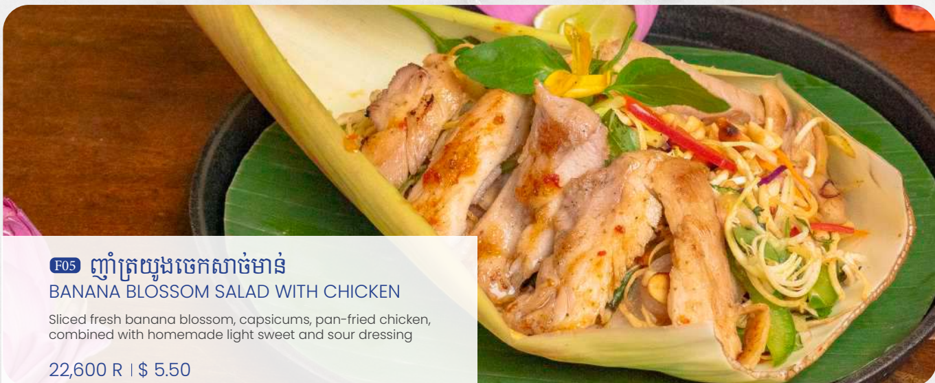
F05 ញ៉ាំត្រយូងចេកសាច់មាន់ BANANA BLOSSOM SALAD WITH CHICKEN

Sliced fresh banana blossom, capsicums, pan-fried chicken, combined with homemade light sweet and sour dressing