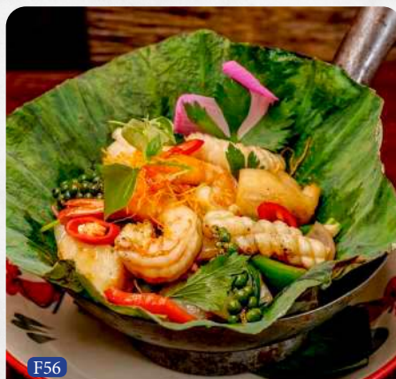
F56 អាត្រឿងសមុទ្រម្រេចខ្លី KAMPOT PEPPER SEAFOOD Wok-fried seafood with green Kampot pepper corn, bell pepper, onion and oyster sauce 43,000 R | $ 10.50