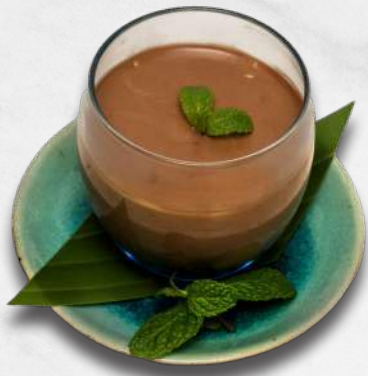
F45 ប្រេចកំពត និង ស្ករក្រហម