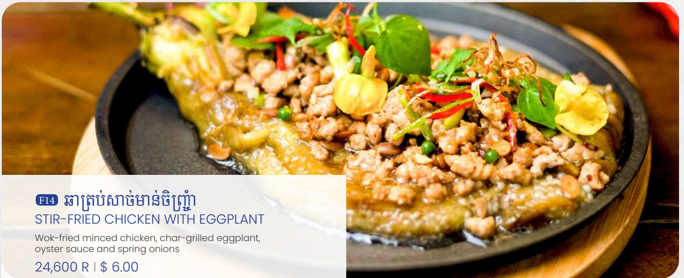
F14 អាត្រប់សាច់មាន់ចិញ្ច្រាំ STIR-FRIED CHICKEN WITH EGGPLANT Wok-fried minced chicken, char-grilled eggplant, oyster sauce and spring onions 24,600 R | $ 6.00