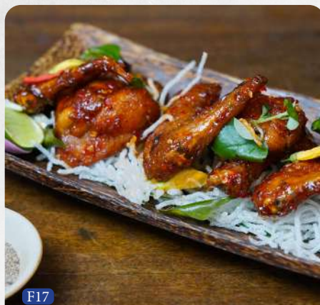
F17 ស្លាបមាន់ដុត ROASTED CHICKEN WINGS Chicken wings marinated lightly spicy garlic paste, served with Kampot black pepper and lime sauce 32,000 R | $ 7.75