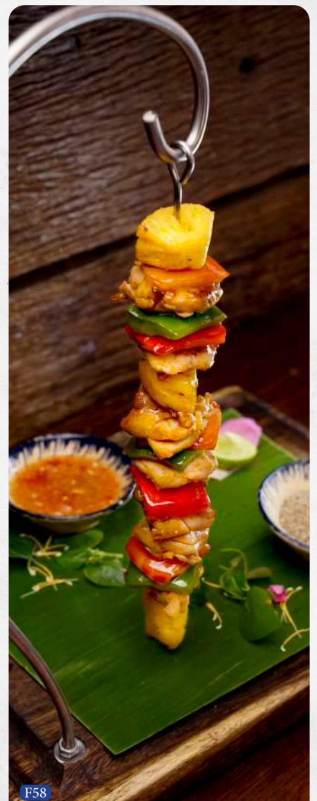
F58 សាច់ចង្កាក់ (សាច់មាន់ | សាច់គោ) BBQ CHICKEN | BEEF Marinated chicken or beef with homemade BBQ sauce, mixed vegetables, served with lime and black pepper dip Chicken 36,000 R | $ 8.75 Beef 43,000 R | $ 10.50

All prices are subjected to 7% service charge