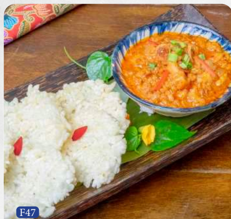
F47 ណាតាំង NATANG

Minced prawn and pork cooked with fresh coconut milk, tamarind juice, dry sweet chili, served with rice crackers