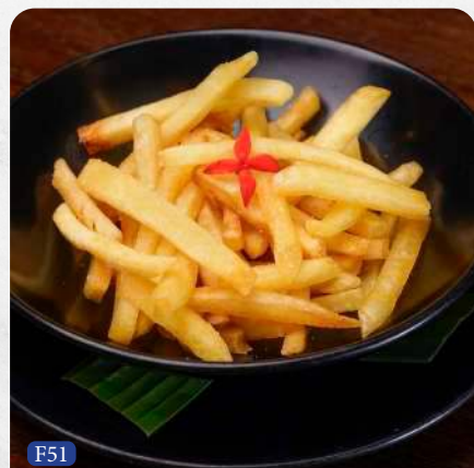
F51 ដំឡូងបារាំងបំពង FRENCH FRIES