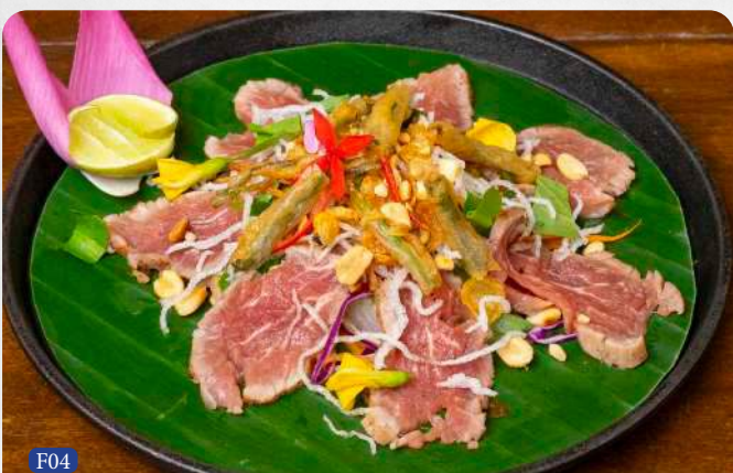
F04 ញ៉ាំសាច់គោត្រកូនស្រួយ CAMBODIA BEEF SALAD

Sliced beef mixed with Koh Kong dressing, crispy morning glory, cabbage, local herbs and roasted peanut